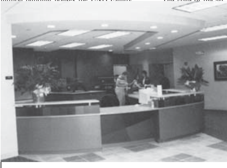
Reception area for the Family Practice Center

Open to the public, the clinic offers health care services in family medicine,