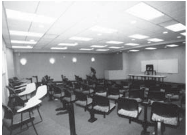
The Clinical Education Center's auditorium, awaiting final furnishings, will seat 78, with accommodations for four wheelchairs.

The center also includes a 70-seat auditorium to be used for educational presentations to school and community