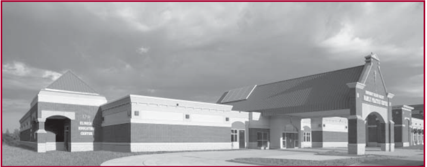
The new University Health Facility at North Columbia Road and Sixth Avenue in Grand Forks